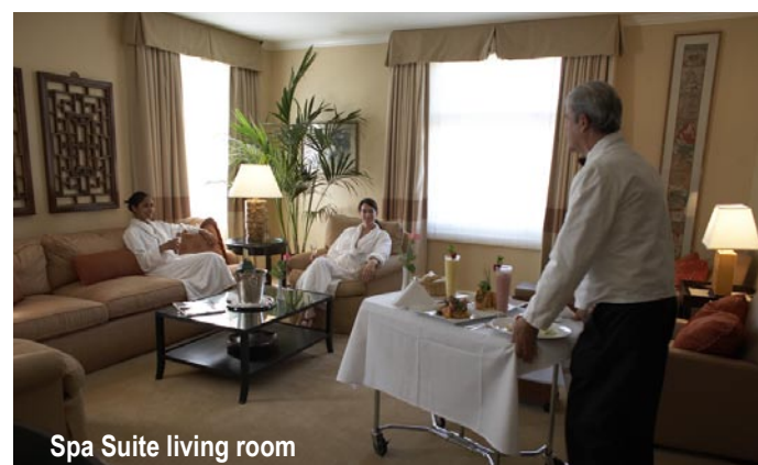
Spa Suite living room

No matter the occasion, we will guide you every step of the way to ensure your event is spectacular. Please contact our Spa Groups Concierge at (415) 345-2860 to begin the planning process.